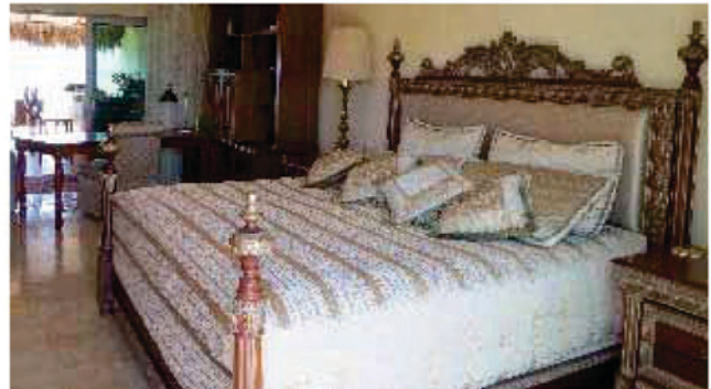
Palapa floor huge master with ensuite and office setup.