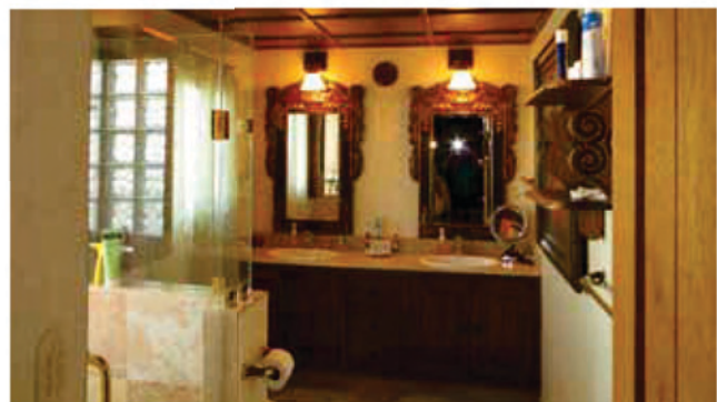
Palapa master ensuite including huge sit-down marble shower and double sinks.