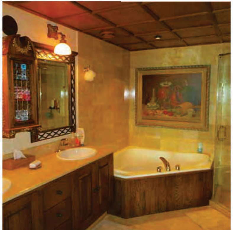
En suite bath attached to first-floor master. Jacuzzi tub, walk-in marble shower.