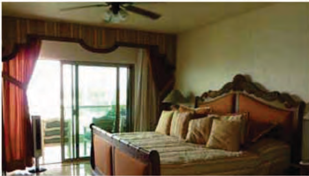
Spacious second master with gorgeous built-in closets/television system.

1 st floor : 2 balconies, living/dining, custom kitchen, 2 bedrooms (King, 2 Queens) with ensuites, 2 TVs, washer/dryer