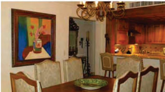
Dining for six in main floor dining room, surrounded by original Mexican art.