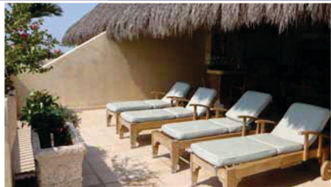
Private sunbathing on your own palapa. Includes bar and dining area 30 by 30.