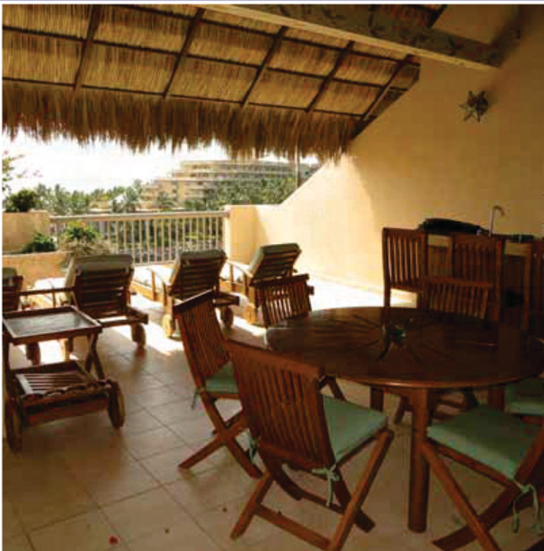
The Palapa (Mexican for grass hut balcony) includes dining area, bar, TV, sunning spot and full bathroom with shower!

2 nd floor : master/den/ensuite, living room, huge private balcony, bar, TV, common pool/hot tub