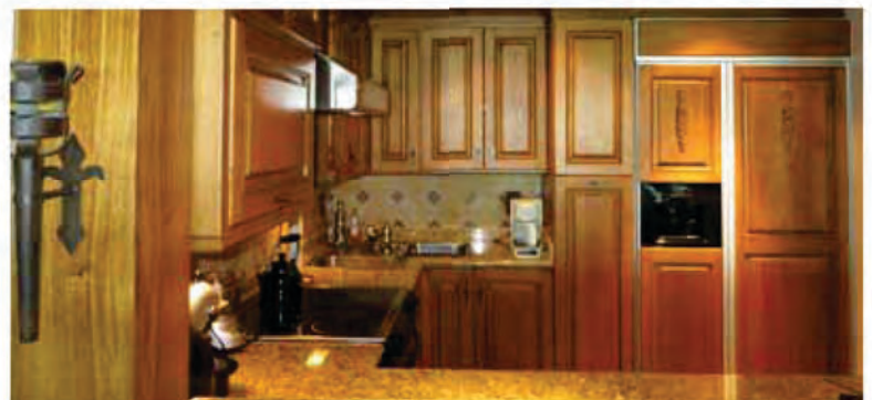
Gorgeous peroba wood kitchen. All built-ins, microwave, refrigerator, dishwasher.