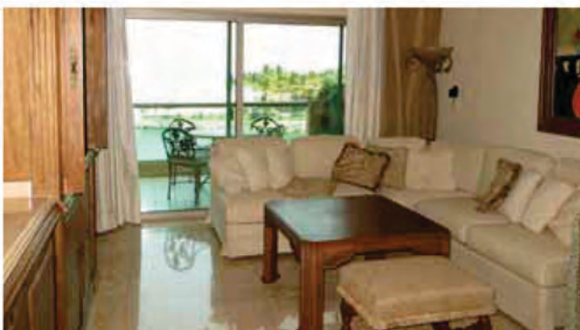
Wraparound Living Room facing built in television system. Beautiful water view!